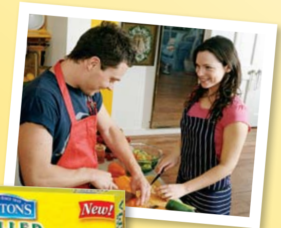
Signature Grilled Tilapia over Cabbage Slaw