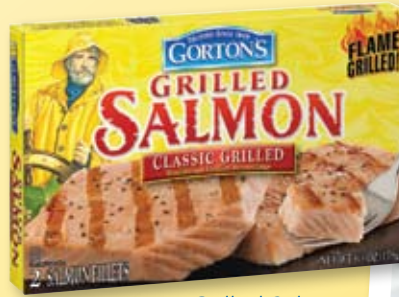
Grilled Salmon Caesar Salad

The Food and Drug Administration (FDA) recommends that pregnant women eat 2-3 servings of fish per week (up to 12 ounces).