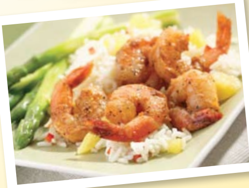
Grilled Shrimp with Rice and Veggies

The American Heart Association recommends that we eat fish at least two times per week.